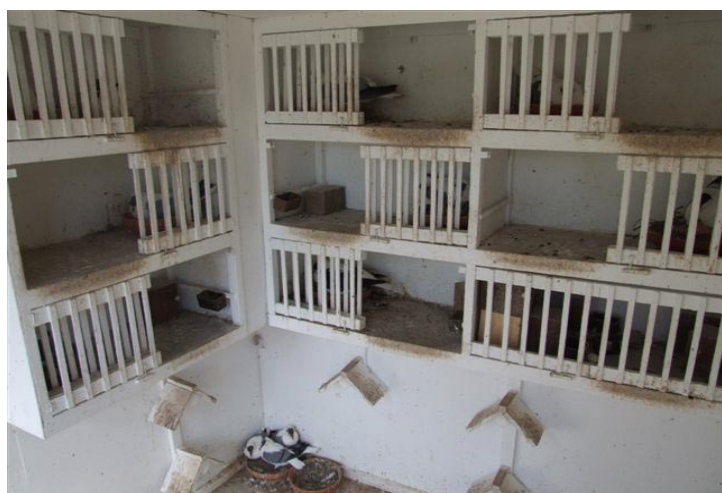
Here we are inside Bens breeding loft - note small water and food cups mounted to a horizontal small board inside each breeding compartment. He uses red clay bowls for nesting and offers them tobacco stems for nest material.