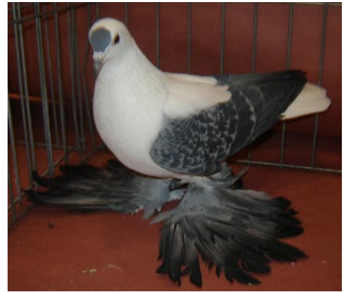
Beautiful blue check Silesian shown by Kim Bartz, Rated S95