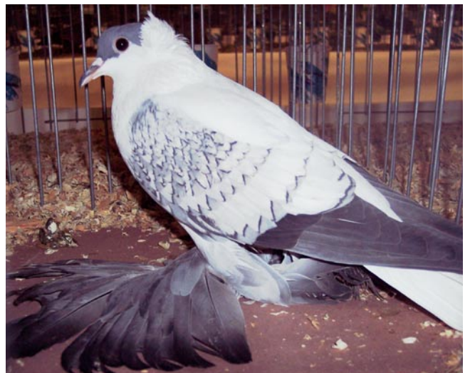
Leon Stephens' best Fullhead Swallow, Blue Spangle, Old Cock No. 11 Rated S95.