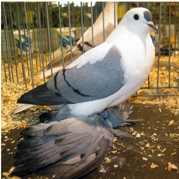
Bill Griebel's Champion Swallow Blue black bar Silesion, Old hen No. 432 Rated E97