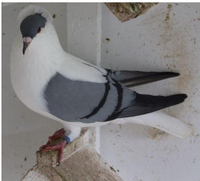
A perching 2006 bred Blue Black Bar