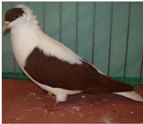
Best Thuringer Swallow Red barless Rated HS96, Elliot Yeske