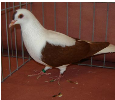
Best Thuringer Wing Pigeon Red barless Rated S95, Gerald Kress