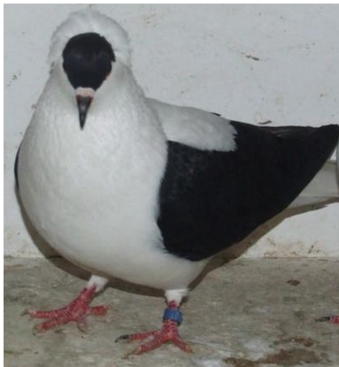
A very nice 2006 bred Black Barless