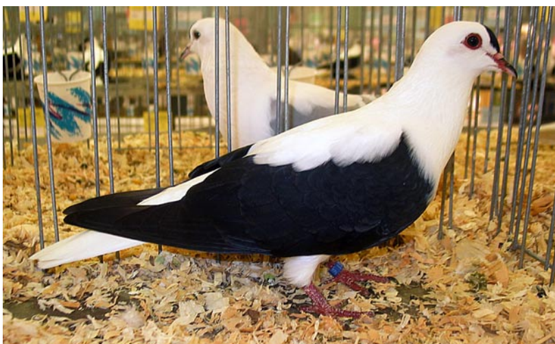
Jay Beal's best Thuringer Wing Pigeon, Black barless Old Hen No. 1181 Rated HS96.