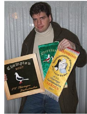
Best in Black with 96 points, champion with twice V 97 points with Blue Black Barred. Second in Barless with twice HV 96 points