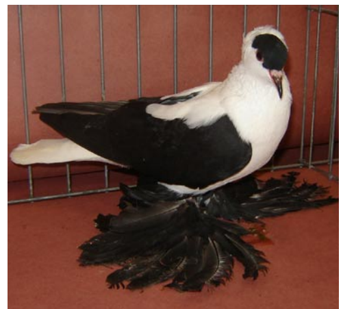
Best Fullhead Swallow, black barless Rated S94, Chris Lindbom