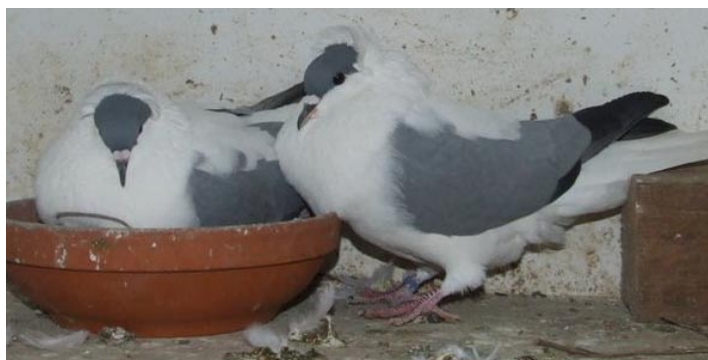
A pair of nesting Blue Barless

also raises Nurnberg Fullhead Swallows plus a good breeding group of Damascenes. In 2000 his Crested Blue Black Barred Thuringer hen received the mark of best Fullhead Swallow and best foreign bird on Thuringer Hauptsonderschau in Plaue (Germany) every one wanted to buy this hen from him. He tells me he is glad that he did not sell this hen because her offspring are still very good birds.